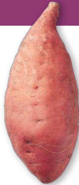
1 MEDIUM-SIZED SKIN-ON WHITE POTATO (148 G)